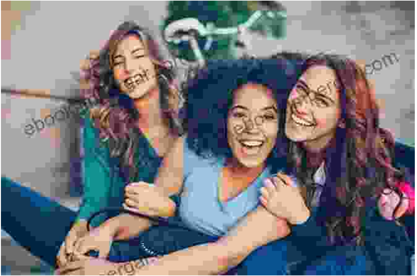
The vibrant and carefree spirit of Vietnamese women.