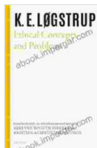
Ethical Concepts and Problems (Selected Works of K.E. Logstrup)

Central to Løgstrup's ethical framework is the notion of the uniqueness of human existence. Unlike other creatures, humans possess the capacity for conscious reflection, self-awareness, and the ability to make choices that shape our lives and the world around us. This uniqueness imposes a profound ethical responsibility on individuals, as we are accountable for the consequences of our actions and the impact they have on others.