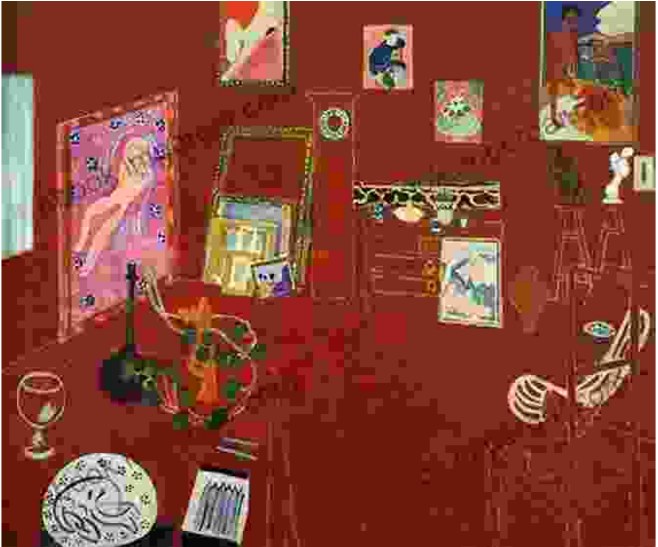
Henri Matisse, The Red Studio (1911)

form, structure, and composition. Masterpieces such as "The Red Studio" (1911) and "The Moroccans" (1912) showcased Matisse's ability to create harmonious and visually striking paintings.