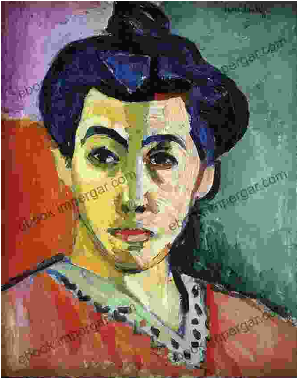
Henri Matisse, The Green Stripe (1905)