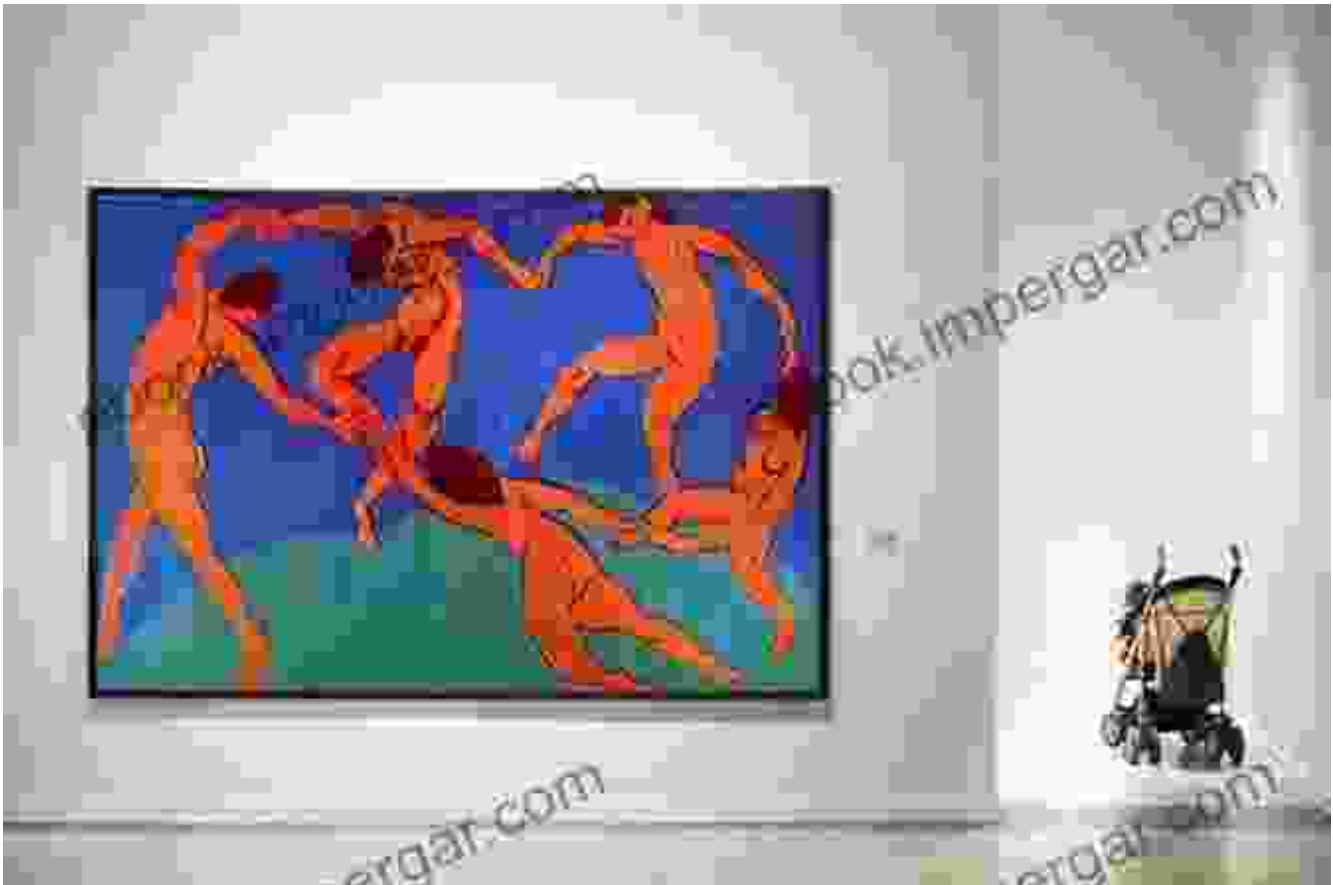
Henri Matisse, The Dance II (1932)

(1953) and "The Dance II" (1932) demonstrated his enduring ability to innovate and reinvent his style.