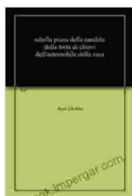
tabella piana della candela della torta di chiavi dell'automobile della casa

Making a candle cake is a fun and easy way to celebrate a special occasion. With the right tools and ingredients, you can create a beautiful and delicious candle cake that will impress your friends and family.