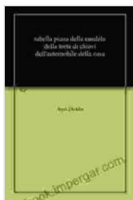
tabella piana della candela della torta di chiavi dell'automobile della casa