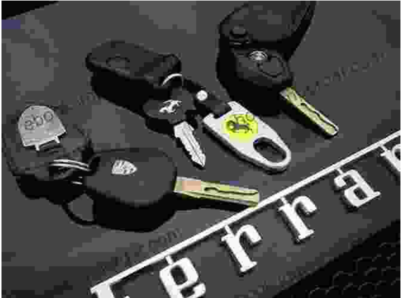
Tabella Piana Della Candela Della Torta Di Chiavi Dell Automobile Della Casa