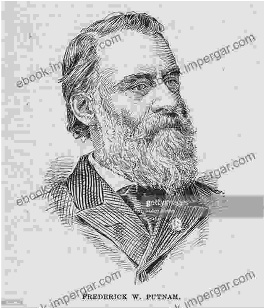
FREDERICK W. PUTNAM.

Frederick Ward Putnam , a renowned anthropologist and curator, played a pivotal role in organizing the fair's anthropological exhibits. His leadership paved the way for the establishment of the American Museum of Natural History and the Jesup North Pacific Expedition, which made significant contributions to the field.