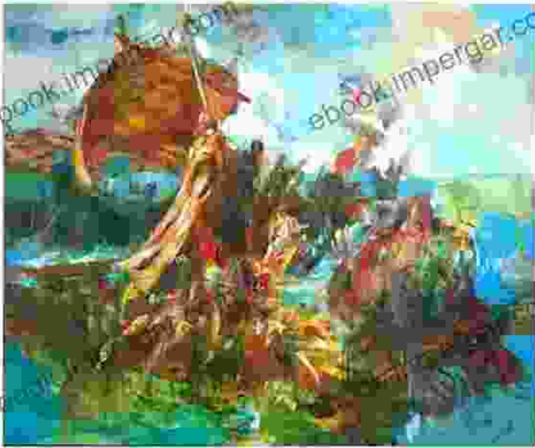
In Homage to Gericault ink + acrylic on canvas 30" x 36"